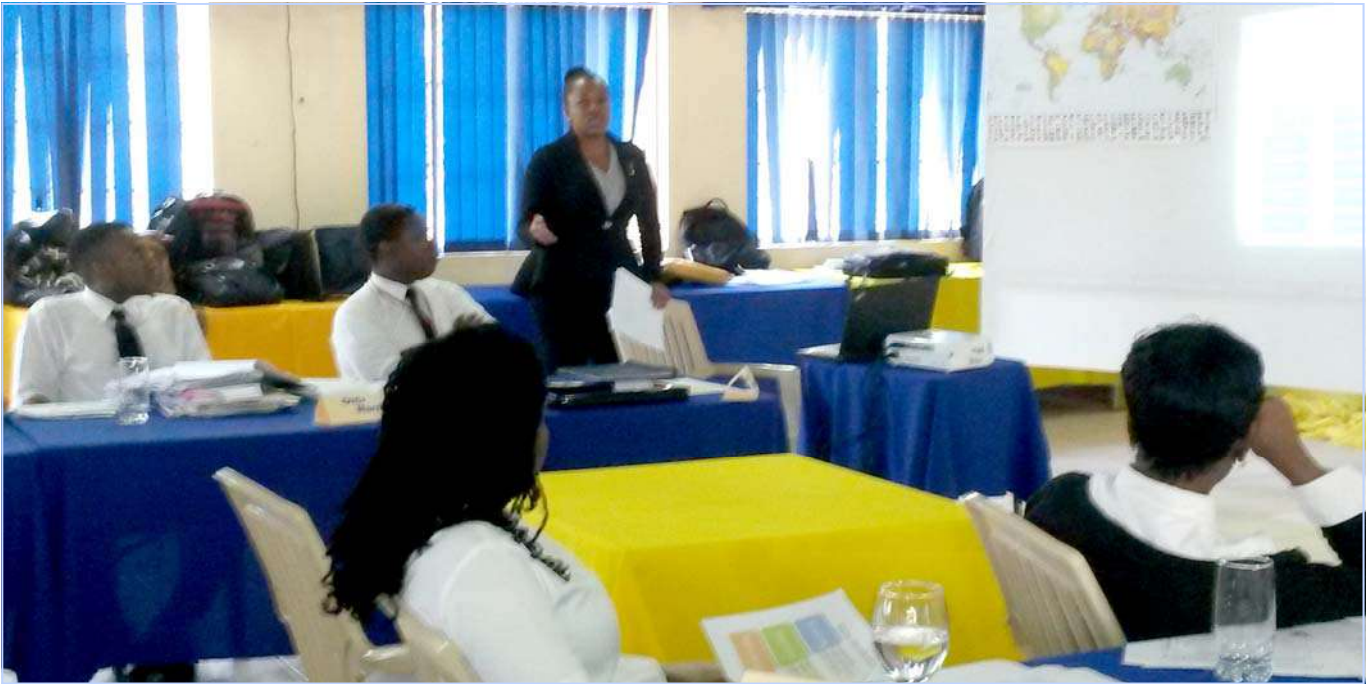
IOM Session on Trafficking in Persons with newly recruited Immigration Officers

and migrants globally through various related initiatives. In Jamaica IOM has conducted the following activities: