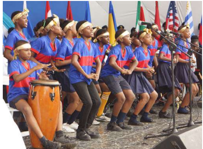
Roseau Primary students performing at Launch of Regional Vaccination Week

Policy in 2013 facilitated the development of the National Infant and Young Child Feeding Strategic Action Plan 2015-2020. Support is also being provided for the development of the National Operational Action Plan for the Prevention and Control of Obesity in Children and Adolescents in