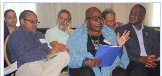
2015 Stakeholder consultation on stigma and discrimination