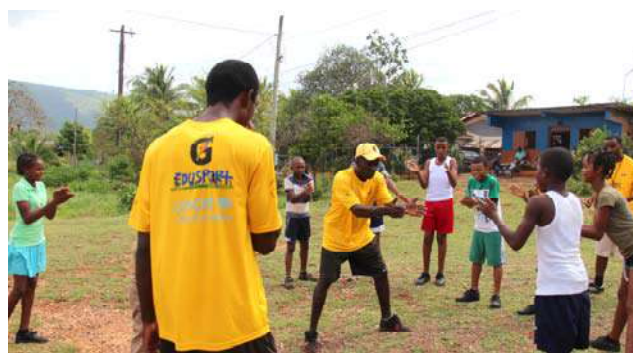
EduSport coaches lead a session at a school in St. Elizabeth. The UNICEF-supported programme provides structured sports and recreation and uses games-based learning to teach key life skills.