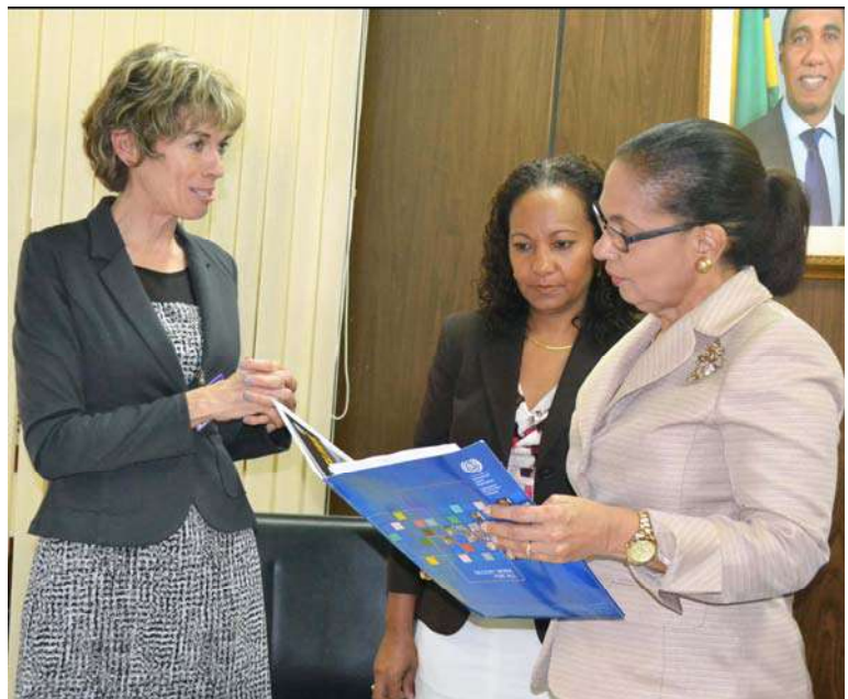
L to R Ms. Claudia Coenjaerts, Director, ILO Decent Work Team and Office for the Caribbean, Mrs Colette Roberts-Risden, Permanent Secretary, Ministry of Labour and Social Security, Jamaica and the Hon. Shahine Robinson, Minister of Labour and Social Security, Jamaica

The central role of decent work in the Sustainable Development Goals is highlighted by Goal 8, which aims to “promote sustained, inclusive and sustainable economic growth, full and productive employment and decent work for all”. In other words: decent work does not just happen; it is a policy choice. But decent work reaches well beyond Goal 8 and is implicated in practically all the other 16 Goals. This illustrates the integrated nature of the SDG agenda as it brings together economic, social and environmental dimensions. It highlights the importance of “one UN” supporting the Government in achieving that ambitious agenda.