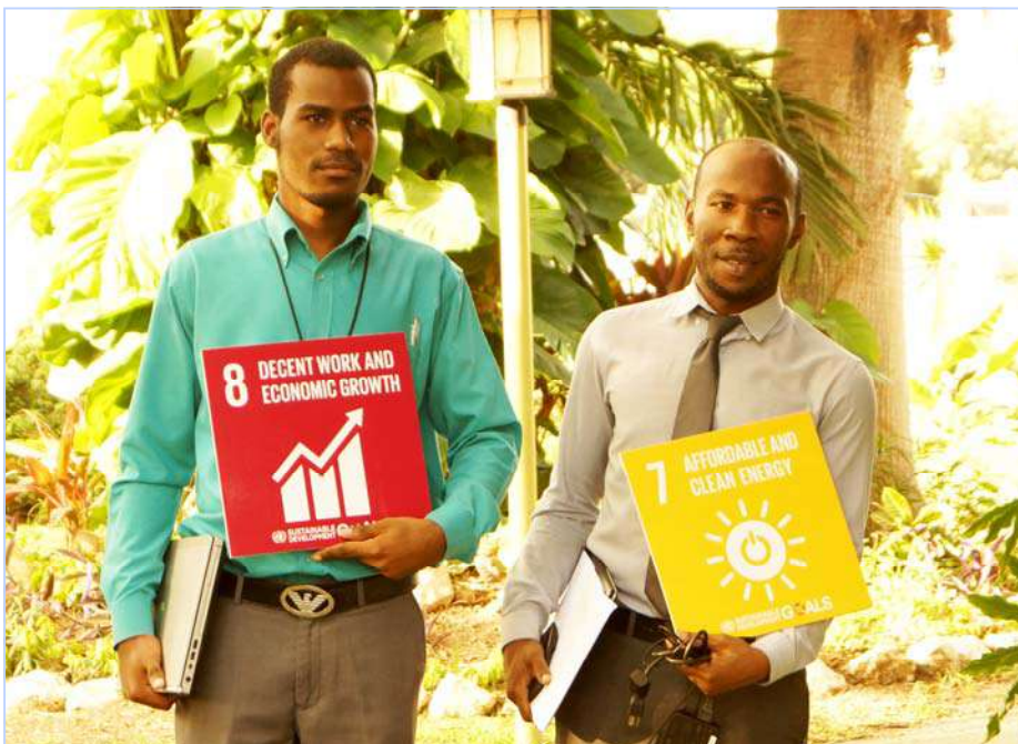
Participants promoting the Sustainable Development Goals at an event to commemorate World Day Against Trafficking in Persons

To view the goals and their respective 169 targets please visit: https://sustainabledevelopment.un.org/sdgs