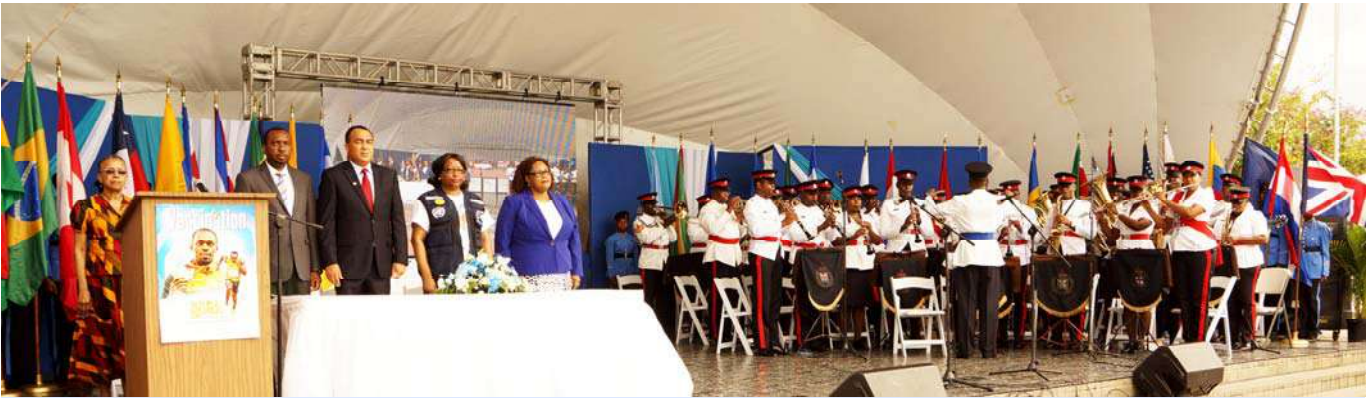
Regional Launch of Vaccination Week in the Americas, Emancipation Park.

Achieving Universal Health Coverage (UHC) is a target of SDG3 which underpins the achievement of several of the other goals and targets. PAHO/WHO is providing technical support for the implementation of the interconnected strategies for advancing universal access to health and UHC. Several high level multi-sectoral consultations were supported in 2015 to define critical elements for achieving UHC. In 2016, technical cooperation has included the establishment of baselines for monitoring of UHC, support to strategic planning for health sector development with attention to health financing options, strengthening people centered quality services, facilitating ongoing access to low cost, quality medicines for HIV and other priority diseases through the PAHO Strategic Fund. In addition, the strengthening of information systems for health is critical for reporting progress on the SDG targets and support continues for the implementation of the National Health Information System and e-Health Strategic Plan as well as the development of a compendium of health indicators for Jamaica's national development plan, Vision 2030.