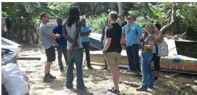
The representatives from the Trash Free Partnership International engage in discussions with Fisherfolk in Oracabessa, St. Mary in Jamaica.

Jamaica also hosts the UNEP Administered Regional Seas Programme for the Wider Caribbean Region, UNEP Caribbean Regional Coordinating Unit (CAR/RCU) which serves as Secretariat to the Cartagena Conventions and its three Protocols on Oil Spills, Biodiversity and Pollution. Jamaica is a Party to the Cartagena Conventions and the Protocols on Oil Spills and Biodiversity. This UNEP Caribbean Environment Programme (CEP) supports Jamaica particularly towards the achievement of SDG 6 on Water and Sanitation and SDG 14 on Oceans. Recent activities include the cooperation with the US EPA and Peace Corps on a Trash Free Programme, as well as large GEF funded projects on wastewater (CRew) and watershed and ecosystems management (IWECO).