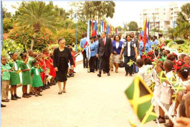
Cadets and students formed the guard of honour at Regional Vaccination Week

SDG 2 – End Hunger, Achieve Food Security and Improved Nutrition and Promote Sustainable