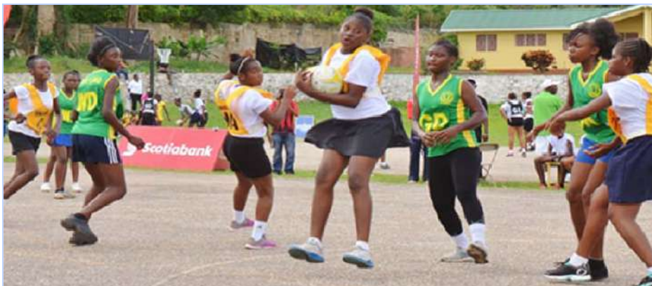
Netball players show their skills during a rally at Manchester High School in Jamaica. A UNFPA-supported programme in collaboration with Netball Jamaica is showing young people how to apply their skills to making healthy choices.

Support capacity development of health care staff to build stronger health systems and widen access to a reliable supply of contraceptives and medicines for maternal health.