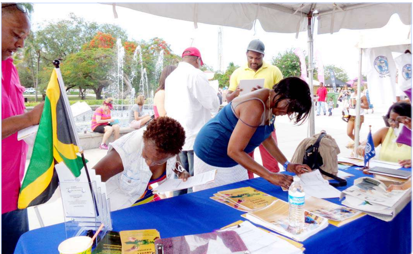
Jamaicans in Florida completing Diaspora Mapping survey at Colors of the Caribbean Arts Festival

Of particular note is Goal 10, target 10.7: 'facilitate orderly, safe, regular, and responsible migration and mobility of people, including through the implementation of planned and well-managed migration policies'. IOM has made great strides in this area over the years, supporting governments