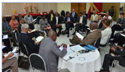
UNAIDS Lancet Commission on defeating AIDS and advancing Global Health held in Kingston Jamaica in 2013