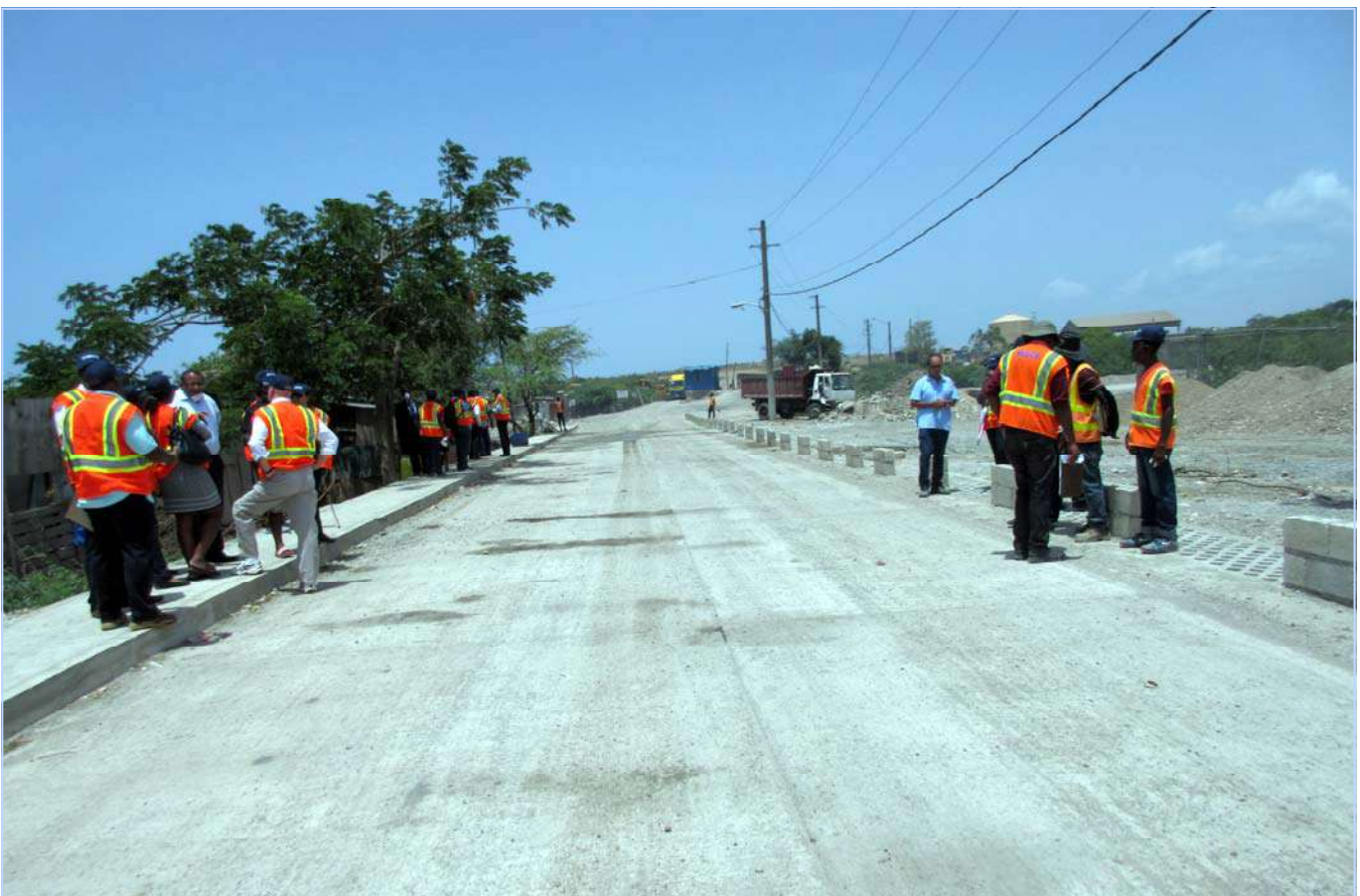
UNCT members on a tour of the new concrete access road project in Riverton City, being implemented by UNOPS, with grant funding from the Government of Mexico.

The Declaration adopted UNAIDS 90-90-90 treatment targets, committing the world to almost doubling the number of people on HIV treatment by 2020 as well as ensuring 1.6 million children living with HIV are on treatment by 2018. It also prioritizes the elimination of mother-to-child HIV transmission, service provision for key populations and efforts to end gender inequality and stigma and discrimination. UNAIDS is committed to supporting the people, government and civil society organizations of Jamaica as they pursue these goals.