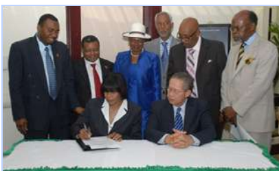
2011 signing of the Declaration of Commitment to eliminate discrimination and gender inequality affecting Jamaica's HIV/AIDS response, by the then Prime Minister and the leader of the Opposition.