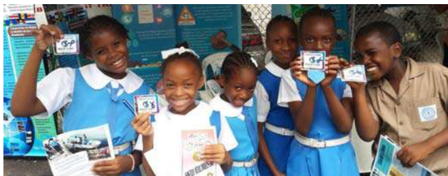
Children at the NEPA Open Day and Environmental Fair in Kingston, Jamaica show their support for the ocean environment and all marine life.

UNEP is committed to work with all countries to support the implementation of the Sustainable Development Goals (SDGs). UNEP promotes environmental sustainability as a crucial enabling factor in implementing the SDGs and ensuring the health of the planet. UNEP's goal is to support all countries including Jamaica to ensure integration of the