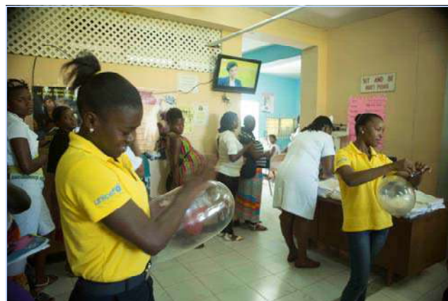
Mentor moms from the UNICEF-supported "I am Alive" programme run a session on sexual and reproductive health for expecting moms. I am Alive is an empowerment and life