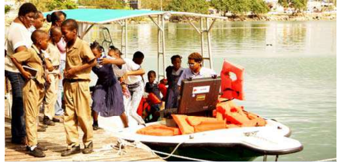
Teachers and students from Falmouth All-Age School enjoy the Montego Bay Marine Park – a National Protected Area

In the area of democratic governance, whereas policies and strategies are in place to support the spectrum of necessary interventions both