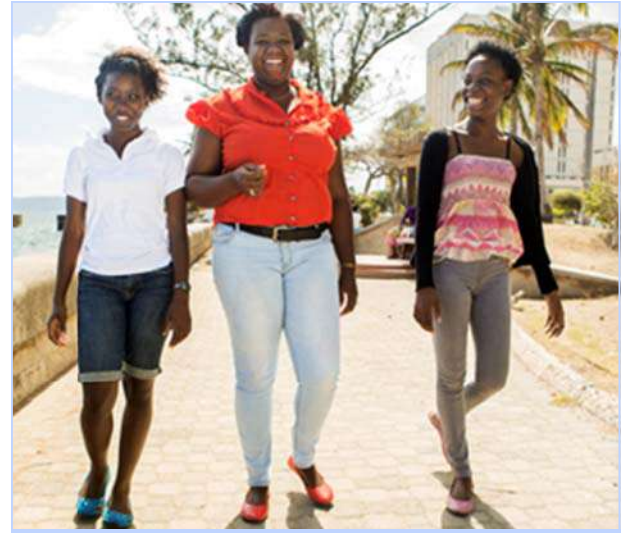
Through its Youth Advisory, UNFPA facilitates empowerment of youth, their right to be heard and to participate in leadership.

adolescent pregnancy across the region by 20 % during 2014-2019. UNFPA also supported the development of the Policy on the Re-Integration of Adolescent Mothers into the Formal Education System , mandating schools to accept adolescent mothers after having their babies. Support was also provided to the development of a National Strategic Plan for Pre-Adolescent and Adolescent Health .