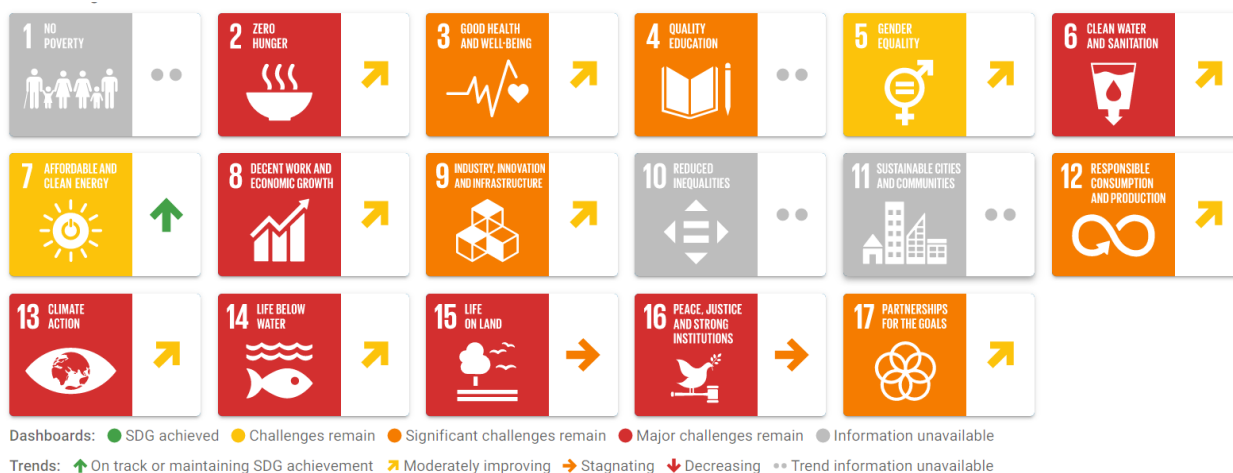
Figure 1: 2022 SDR Dashboard – The Bahamas

The previous CCA highlighted that progress towards each of the SDG indicators, as tracked by the United Nations, only provides a partial picture of country-level SDG progress. The 2022 Sustainable Development Report (SDR) provides some